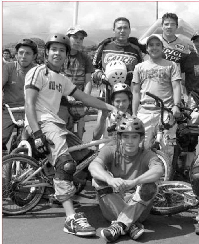
Apostolic and Prophetic Marantha Mission - Guatemala City, Guatemala

As our name implies, the Mustard Seed Foundation provides seed funding for small start-up projects of churches and Christian organizations around the world. We seek to partner with local congregations that identify, equip, and support their members who are called to specific areas of ministry in the Church and society. We look for initiatives that offer innovative approaches to local church-based ministries. The Foundation seeks to help launch projects as a minority partner, providing funds over a limited time period, and in a way that encourages self-sufficiency and reliance on the local church. We consider local church accountability and financial support to be primary indicators of the priority, integrity, and sustainability of a particular project. A church must be willing to invest financially in a project for us to consider funding that project. The Foundation has a strong interest in the unique challenges faced by the urban church. As the world rapidly urbanizes, we believe that investing in churches located in large cities to be particularly strategic. We typically fund projects that share the gospel with non-Christians (outreach), generate income and economic decision-making opportunities for poorer Christians (empowerment), or equip Christians to better proclaim and demonstrate the gospel (discipleship).